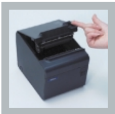
Pull the lever, and open the door until it is fully open.