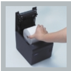
Insert the paper roll.