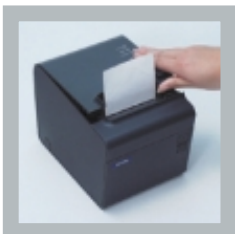
Close the door. The paper is fed automatically.