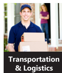
Transportation & Logistics